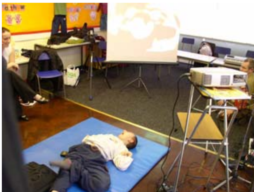
Figure 3 Case study 2 on floor mat with inverted image on screen – helper (left) author (right)