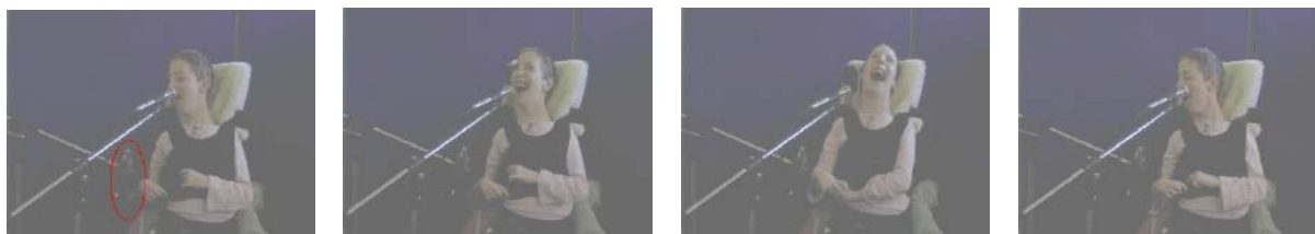
Figure 4 Case study 3 images 1-4 viewing left to right

Case study 3 was a 15 years-of-age, non-verbal, non-ambulant female with cerebral palsy. In her 1st session of 15 minutes, there was far too much interference from staff members for a true analysis of her responses to the environment – for example continuously they kept calling out for her to initiate vocalising and movement. In the second session however, the environment was far quieter. The user was highly stimulated by the sounds her movements made when she was activating the sensor sound module 3 . The sensor area was placed within reach of her right arm (Figure 5, image 1). The tone produced a swooping harsh sound she clearly found amusing as she laughed and smiled. Observations indicated that she had a clear understanding that her movements were generating or affecting the sounds she heard.