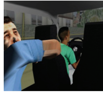
Figure 4. Taxi view.