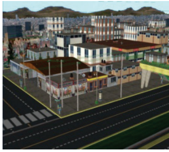
Figure 2. City view.