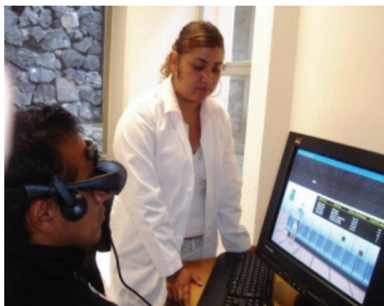
Figure 1. The VR-system provides confidence to the patient to learn that the virtual environment is handled by the therapist through a keyboard or electronic panel that ensures total control of exposure in real time.